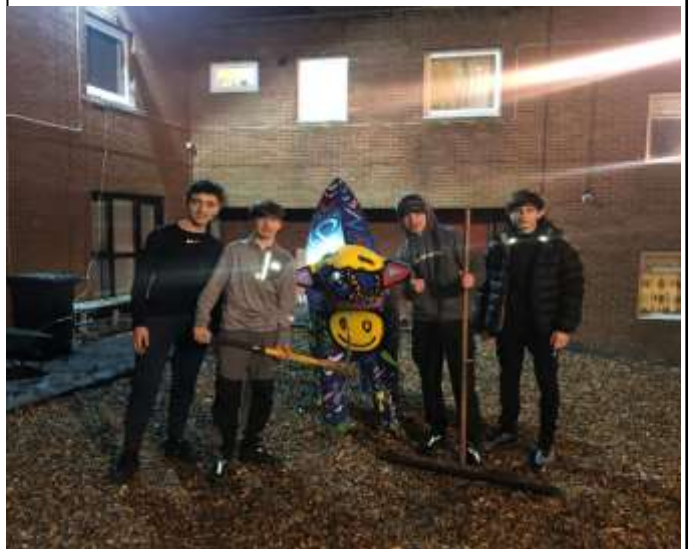
Some Junior Club members (top picture) delighted with the Big Give, and some Senior Club members helping with clearing the Shewsy and St Peter's courtyard.