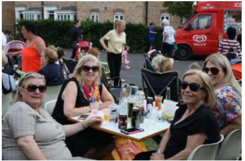
Plenty of socialising, catching up with old and new friends (above and below)