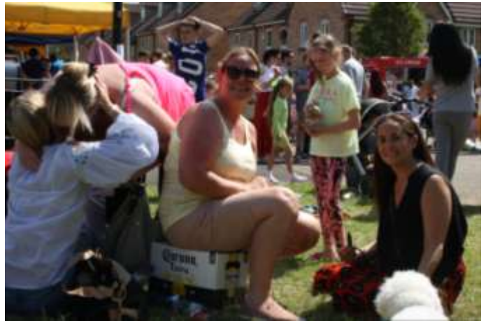
And the sun shone all day with few clouds in the way (below)