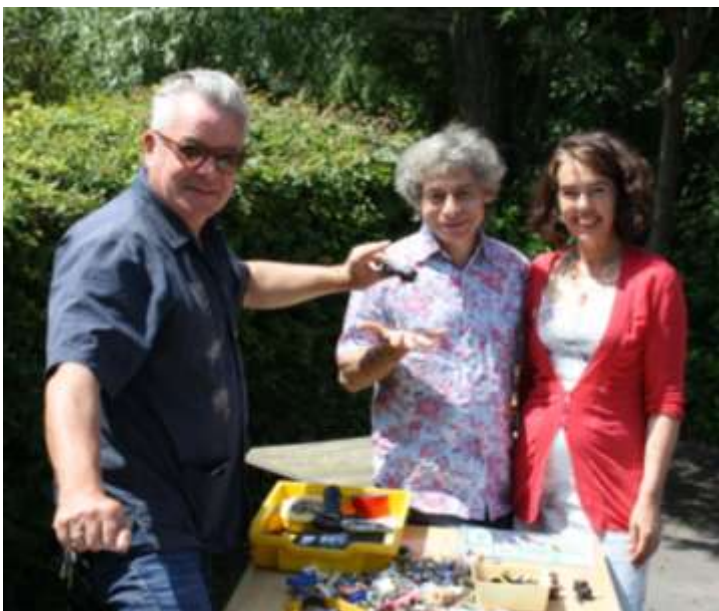
Lovely healthy produce brought over from the Faith plot (above) and some skilful craft and recycling (below), both stalls in the nature garden.