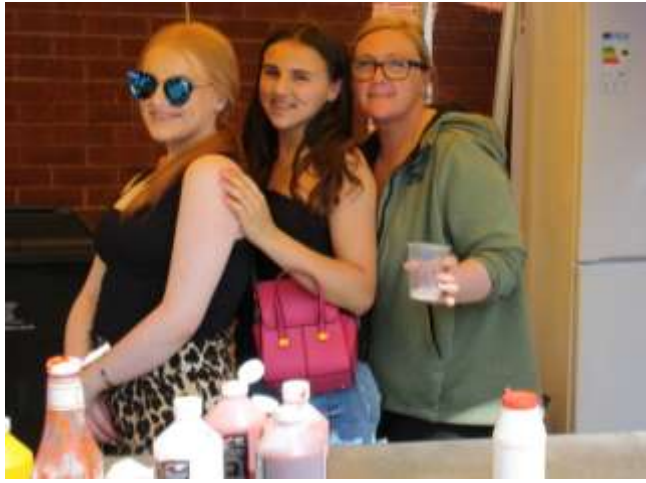
Great work on the bar-b-q (above) and the face-painting (below)