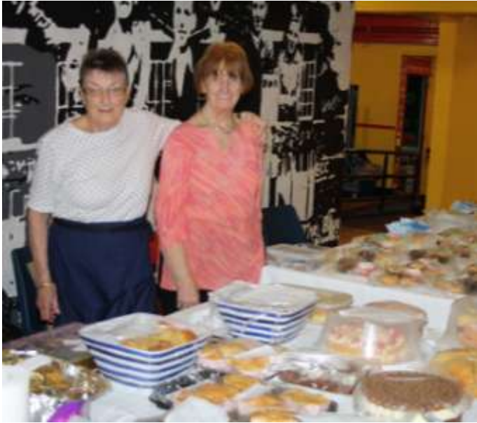
The joys of the cake stall